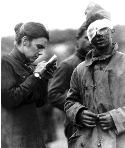
A woman relief worker writes a letter home for a wounded soldier.

Reading Check Summarize How did the governments of the warring nations fight a total war?